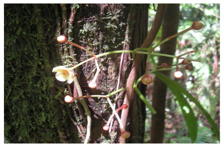
Chrysochlamys caribae -endemic

Top and bottom images by Roger Graveson http://www.saintlucianplants.com/