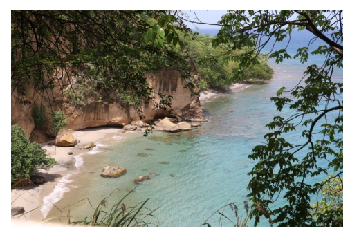
Secret Bay Beach

One cannot help but be captivated by the lush plant life, abundance of water attractions including waterfalls and hot springs, indigenous art and craft and the simple rugged beauty of the island. The Carib name for the island speaks of the natural treasure. 'Waitukubuli– Tall is her body' edifies striking grace.