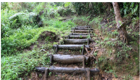
Steps to the boiling lake (above); Hot spring (below).

The Central Forest Reserve is the first reserve established on the island in 1952. This reserve is considered to be the main habitat for tree species used by indigenous peoples for making canoes and other tools. Some of these trees are members of the Bursecaceae family. A further study of this heritage will be explored in the next issue of Plants and Heritage. (caribya.com/dominica)