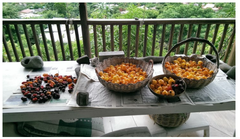
Colour from the tree to spice on the table

<u>Acalypha elizabethiae</u> <u>Bernardia laurentii</u> <u>Chrysochlamys caribaea</u> <u>Cuphea crudyana</u> <u>Daphnopsis macrocarpa</u> <u>Gonolobus iyanolensis</u> <u>Lobelia santaluciae</u> <u>Miconia luciana</u> <u>Miconia secunda</u>