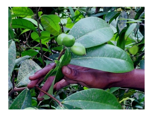
An important endemic species as a source of fibre—Daphnopsis macrocarpa

Each ethnic group left us specific customs; it is the blending and fusing of this traditional knowledge which has given rise to this unique Saint Lucian heritage. It is sometimes difficult to trace the roots from whence our customs sprang due to this fusion of cultures and adjustments made over time to fit our tropical circumstances and landscapes. In some cases, even experts on cultural studies have been baffled by the medley. Therefore, it is essential to conclude that the valley dwellers are the trustees of this important bio-cultural heritage, which still lives in their cultural veins within the local biosphere giving rise to the 'actual network of life' which they continue to shape, as it in turn continues to shape all.