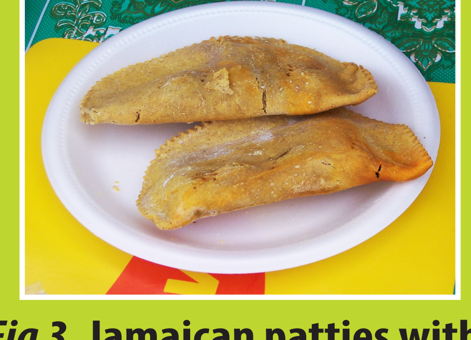
breadfruit crust (Jamaica, 2006)