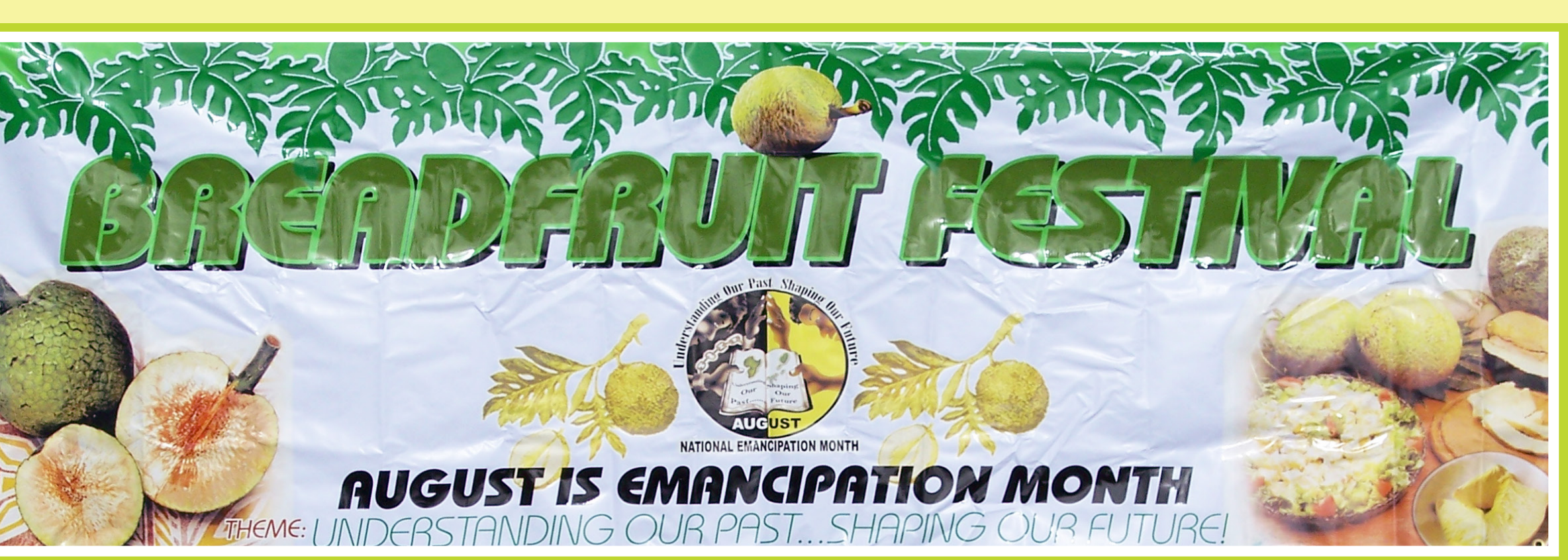
Fig1. Breadfruit festivals represent emancipation (SVG, 2006)

Sponsorship required Fig11 . Information – propagation, health Policy environment often difficult