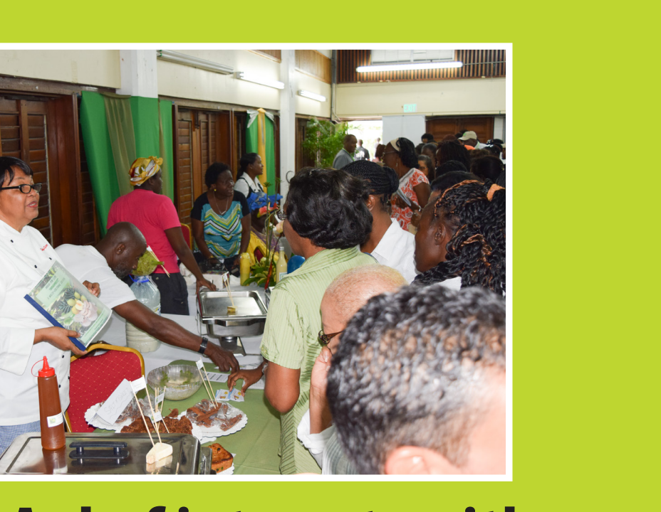
Fig 8. A chef interacts with recipe book (TT, 2015)