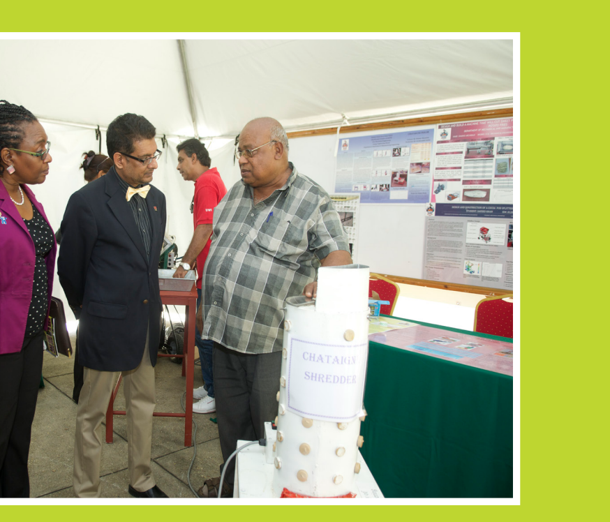
shredder designed at UWI, (TT, 2015)