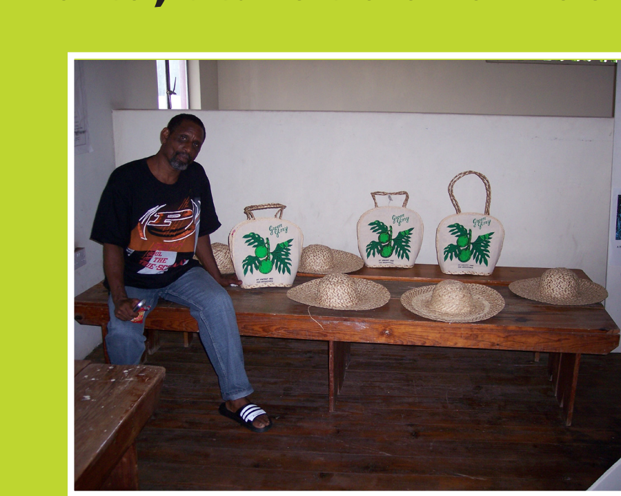
Fig 7. Handicraft maker (St. Vincent, 2007)