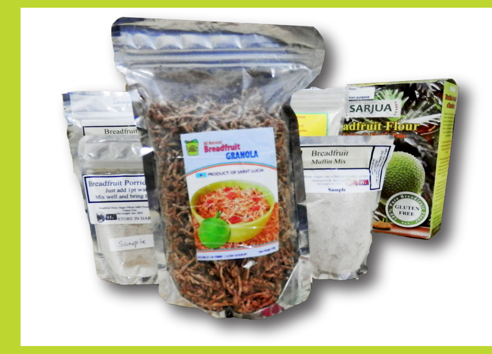
Fig 5. Breadfruit products from Jamaica, St. Lucia and Mauritius at UWI