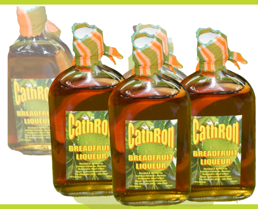
Fig 4. Breadfruit Liqueur (Montserrat)