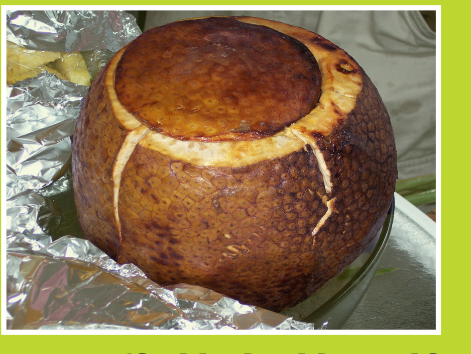
Fig 2. Stuffed baked breadfruit (SVG, 2007)