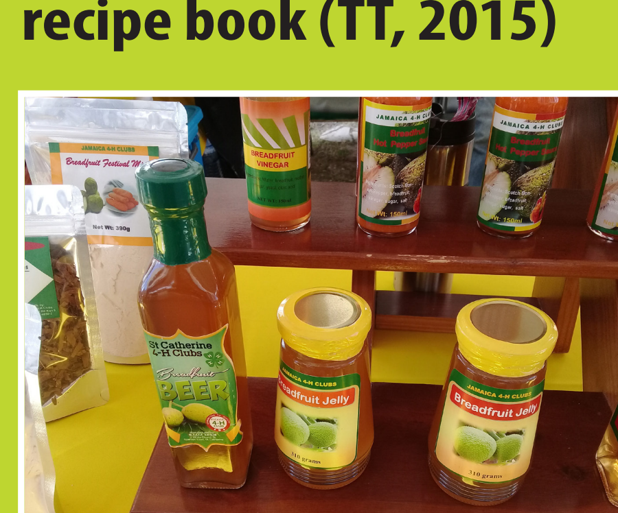
Fig 10. Youth involvement through 4-H in product development (Jamaica, 2018)