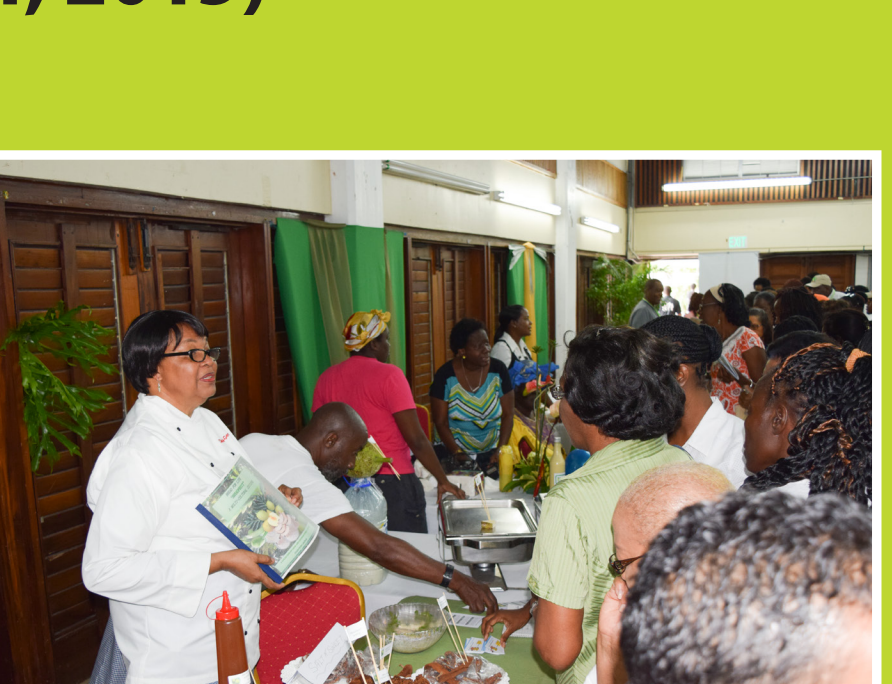
visitors and promotes her