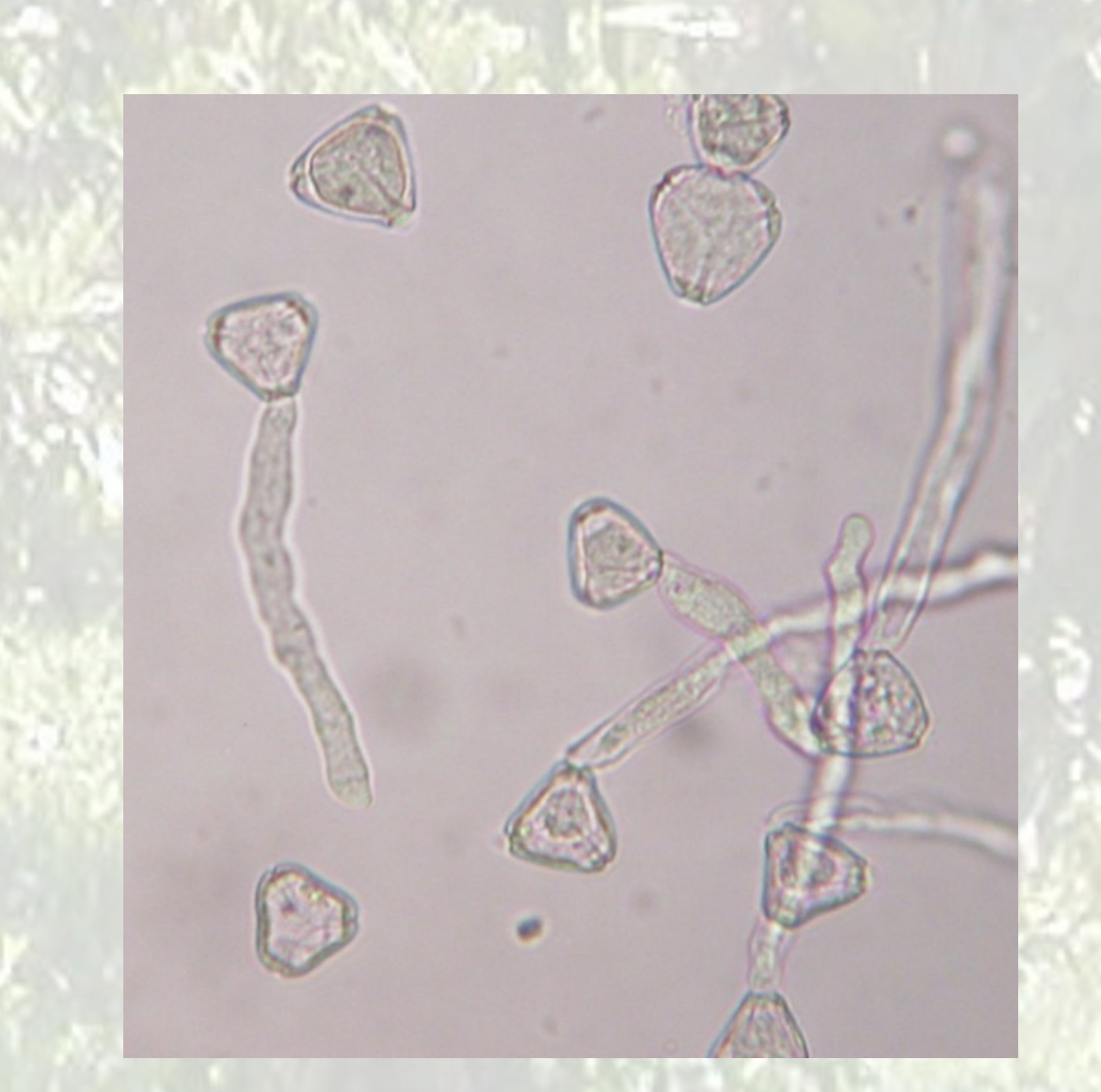
Figure 3: Male pollen growth

The highest germination of pollen from florets of male trees was obtained at 20 % sucrose at 25 mg L<sup>-1</sup> boron and 75 - 150 mg L<sup>-1</sup> calcium. Female pollen also germinated optimally under identical sucrose and calcium levels, but at twice the level of boron (50 mg L<sup>-1</sup>). However, successful pollen tube development was observed in the pollen from male trees, as the pollen tubes of female tree-derived pollen burst within a few hours after pollen tube elongation had begun (see Figure 3 and 4):