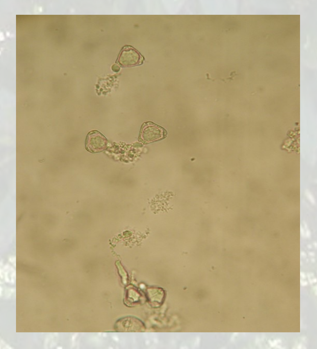
Figure 4: Female pollen tube growth

The styles in the male florets were all straight, while the those in their female counterparts were bent at approximately midway their length.